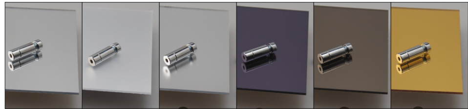
RM942-340 Silver Mirror RM942-341 Ice Silver Mirror RM942-351 Platinum Mirror RM942-300 Carbon Mirror RM942-870 Bronze Mirror RM942-730 Gold Mirror

Rowmark's Reflexions Mirrored Acrylics feature a stunning, easy-to-fabricate metallic surface resembling the look of glass and mirror. Enhance a broad range of decorative indoor applications, from signage and Point-Of-Purchase (POP) projects to accent décor, custom gifts, craft jobs and more!