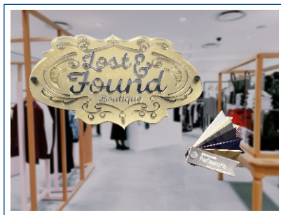
^ Reflexions Samples

Fabricate the ColorCast Acrylics™ Sign Kit by downloading the file found under the downloads section of our website at www.rowmark.com .