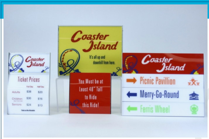
Slickers Sign Kit item #9026

You may place your Slickers Sign Kit order at www.rowmark.com , or fabricate the signs on your own using the file found under the downloads section of our website.