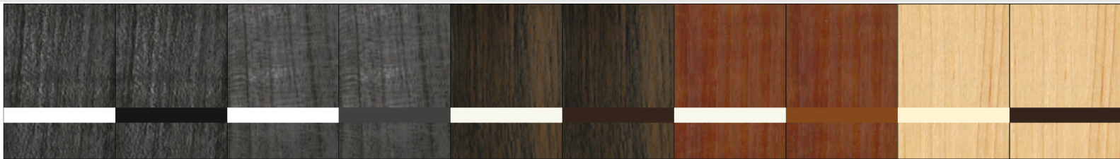
TN9X2-192 Carbon Ash/ White TN9X2-194 Carbon Ash/ Black TN9X2-162 Barnwood Grey/ White TN9X2-168 Barnwood Grey/ Charcoal TN9X2-172 Natural Teak/ Ash TN9X2-178 Natural Teak/ Brown TN9X2-022 Brazilian Cherry/ Ash TN9X2-028 Brazilian Cherry/ Copper TN9X2-134 Beechwood/ Ivory TN9X2-138 Beechwood/ Brown