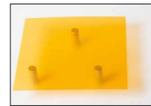
LC669-025 Translucent Orange