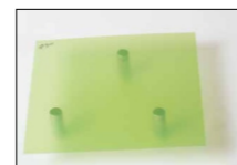
LC999-025 Translucent Green