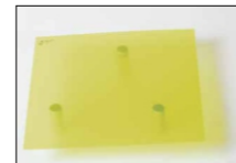
LC729-025 Translucent Yellow