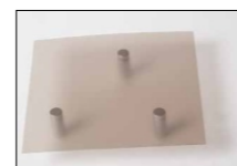
LC342-025 Translucent Smoke