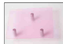
LC679-025 Translucent Pink